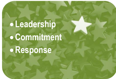
Race at Work Charter

There are 6 elements of the Race And Conscious Equality Charter Mark Framework. These are: