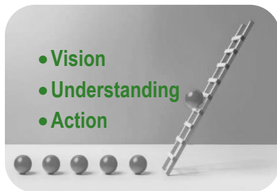
Leadership & Management